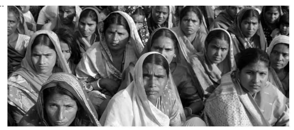
Women in a dalit self-help group in Jehenabad, India.

Beyond this classification, there is a category of 'ati-shudras' or 'dalits' (as they are now called), which falls outside this hierarchy. They were assigned the tasks considered dirty by the rest, such as handling dead animals or manually disposing of human waste. The word dalit in Marathi literally means 'broken'. Subjected to the discriminatory practice of untouchability, which still persists despite being formally outlawed by the constitution of India in 1950, they are denied access not only to common property, such as water and land, but also to equal opportunities in education and work.